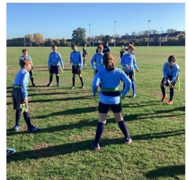
Year 5/6 Rugby Tournament