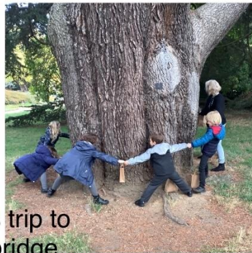
Robins trip to Cambridge Botanical Gardens