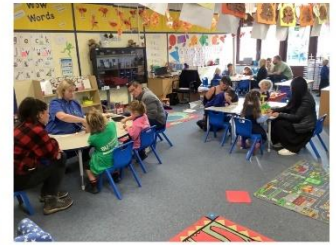
Welcome Weekday - parents joining in with lessons