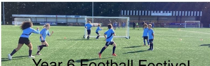
Year 6 Football Festival